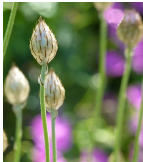
It's easy to fall in love with the silver buds of Cupid's Dart ( Catananche caerulea )

We love to fill our garden with the colour and scent of flowers. For me that passion is concentrated on hardy herbaceous perennials and the appearance of buds signal the new season of flower is about to burst forth.