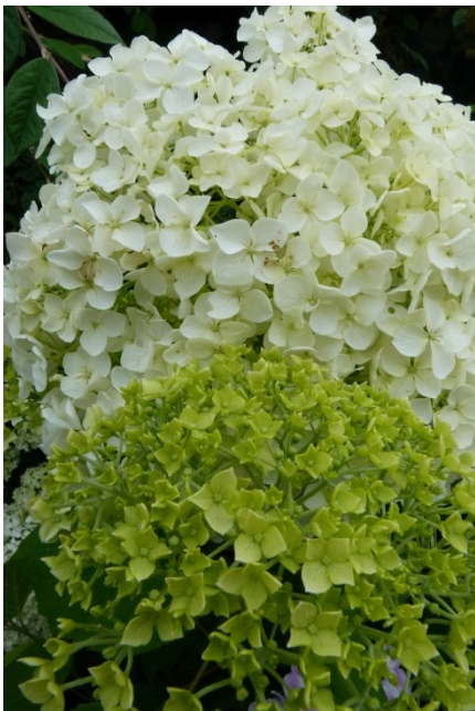
Hydrangea Annabel has a delightful contrast between bud and flower

Poppies are a brief, but dazzling display in the garden but the Orientale Poppy ( Papaver orientale ) has just tactile, silken buds for so long prior to flowering. And of course the flowers are followed by those pepper-pot seed heads.