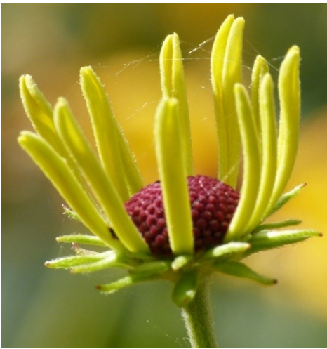
Coneflower, Rudbeckia subtomentosa transforms from delicate to big and blousy between bud-burst and flower

Rudbeckia are prime examples of this transformation as the petals open: from achingly delicate to big, bold and blousy.