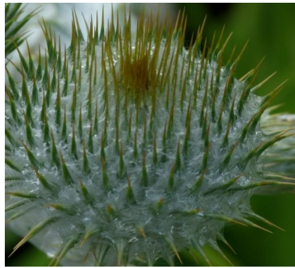
Silk Thistle ( Onopordum ) is a giant biennial

Sometimes the contrast between bud and flower on the same plant lifts a planting to new levels. Hydrangea Annabel is perhaps the best example of this, with lime-green buds and apple-white flowers together through the summer.