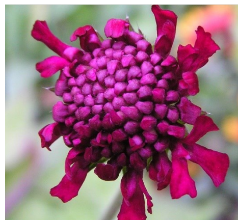
Knautia has pin-cushion buds