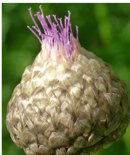
Awaiting a fuchsia-pink explosion from the silver buds of Stemmaacantha

Some flowers are as restrained, quiet and understated in bud as they are exuberant, showy and attention-seeking in flower. The coneflowers ( Echinacea and