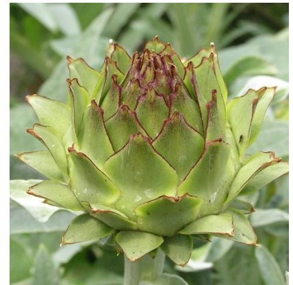
Cardoon is a cousin of the globe artichoke

Visit our website at specialperennials.com