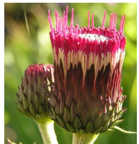
Cirsium rivulare waits in anticipation of the show to come