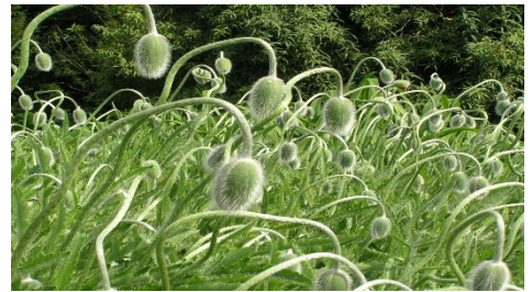
Oriental poppies ( Papaver orientale )

I'm trying to learn to be patient and not want everything to rush into flower. Stopping to appreciate the beauty of buds, new stems emerging, an