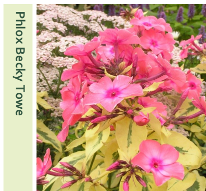
Phlox Becky Towe