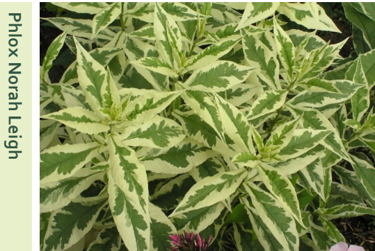
Phlox Norah Leigh